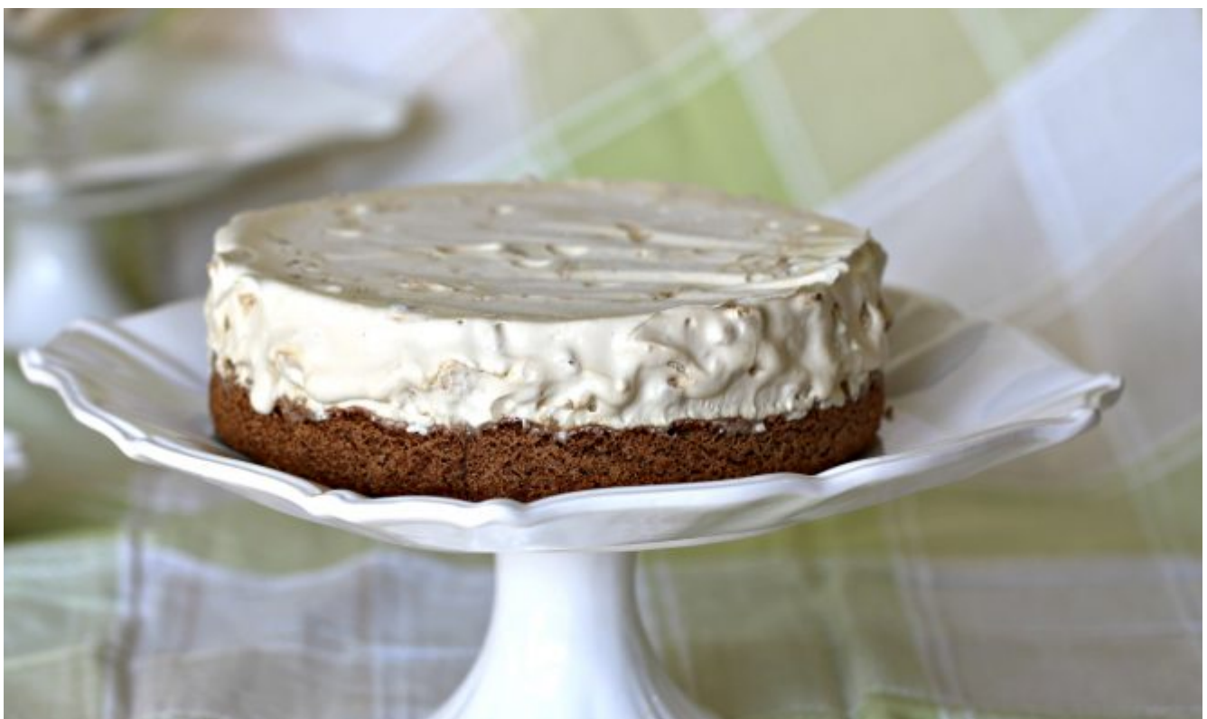
Manuela's Mocca Meringues Ice Cream Cake

Now it's your turn to bake your "Master or Disaster" piece! Remember you must post a photo of your completed dish to the WooBox link (listed below) by July 1, 2018 Midnight CST.