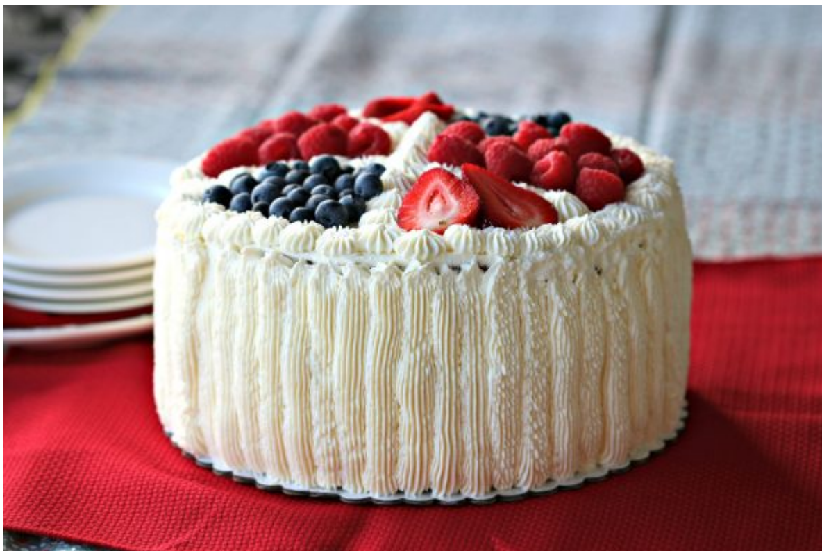
BLØTEKAKE ( NORWEGIAN CREAM CAKE)

I have pushed myself to work outside my comfort zone and I’ve just added two more delicious recipes to my baking repertoire: Norwegian Sponge Cake and Vanilla Pastry Cream . The list keeps getting longer and my skills are growing with every delicious recipe.