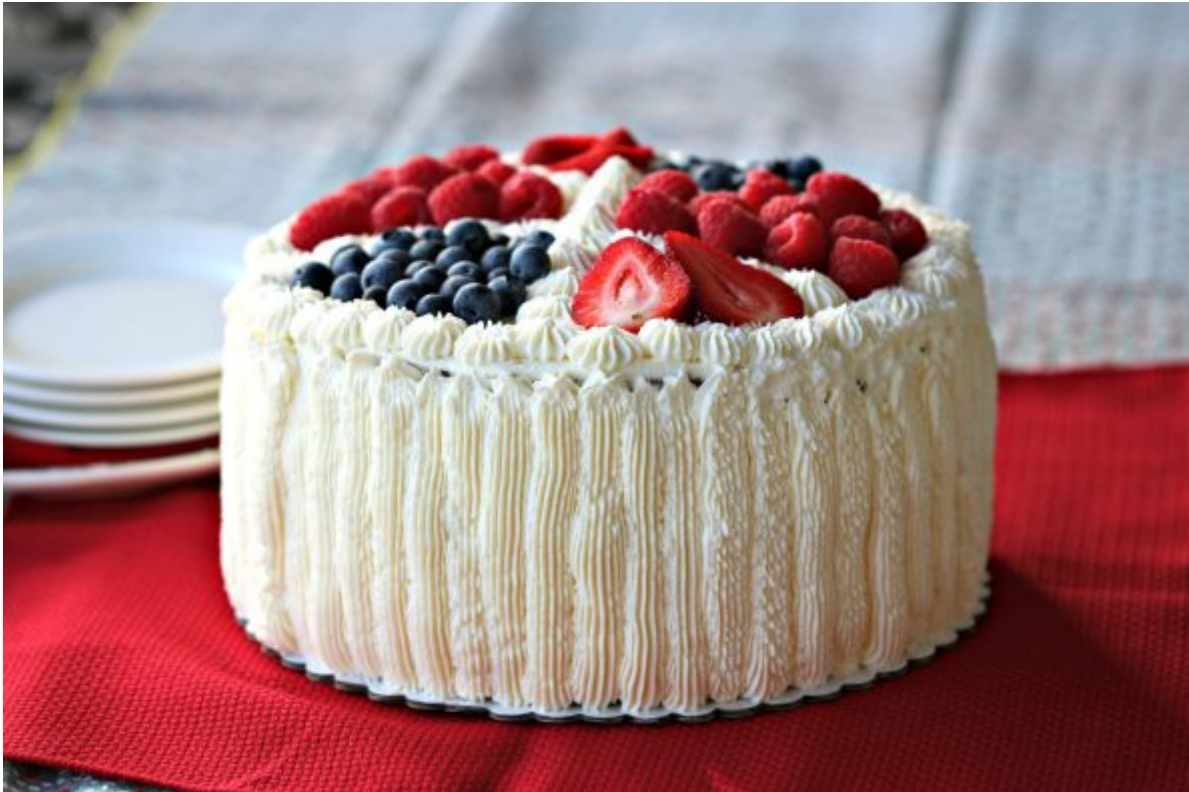
My Rendition of Manuela's BLØTEKAKE NORWEGIAN CREAM CAKE

You'll notice my piping on the sides of the cake are too close together, jagged, and don't look finished where the cake top meets the piped sides. You'll also see that the top of my cake resembles a mosaic or road map rather than the 6 perfect triangle slices on Manuela's cake. My rendition of the cake is pretty, but not correct if we're trying to replicate Manuel's recipe. My decoration looks more like a mosaic than Manuela's 6 perfectly piped triangles