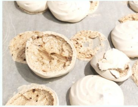
My Mocca Meringues