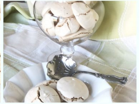
Trying to put lipstick on a pig

I know this makes absolutely no sense to “Master Bakers,”but for someone like me, baking recipes way outside my comfort zone makes me feel like crying. Therefore, being transparent about my failed recipes is difficult to say the least. As if my disaster attempt at the recipe wasn't enough, I managed to finish my first day of baking by dropping my favorite glass mixing bowl onto the tile floor; shattering it into pieces!