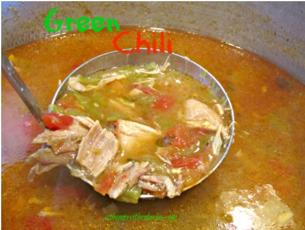
Green Chile Navajo Tacos