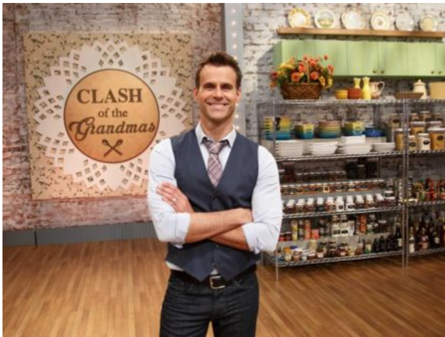
Cameron Mathison Emmy-nominated actor and television host is the co-anchor of the most-watched entertainment news program in the world, Entertainment Tonight.