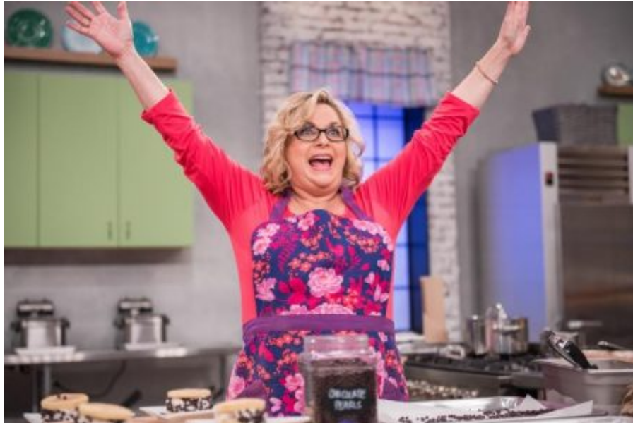
I WON!