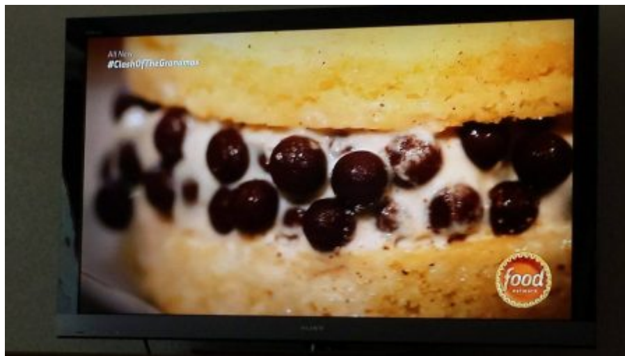
Mexican Biscochito Cookie with Cinnamon Tequila Ice Cream Sandwich. Recipe by Rebecka Evans.

with the six-episode primetime competition series Clash of the Grandmas, premiering Sunday, November 13th at 10pm (all times ET/PT). In each episode, host Cameron Mathison welcomes four grandma super-cooks to the kitchen – but only one emerges as the $10,000 winner. From Thanksgiving stuffing transformations and savory hand-held mac and cheese creations to decadent desserts, these grandmas are reinventing dishes with masterful home-cooking skills.”