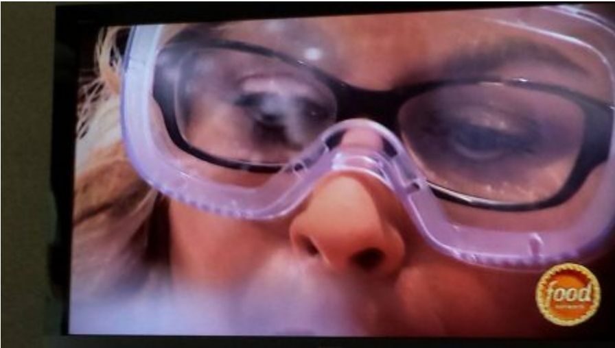
Rocking the goggles using liquid nitrogen.

Making it to the final round was beyond my comprehension. I was competing for $10,000 and I was also about to experience cooking with liquid nitrogen for the first time in my life. I was exhilarated about the opportunity to get my hands on the liquid nitrogen and found myself feeling like a kid in a candy store. Gloves check, goggles check, liquid nitrogen check! I was having so much fun with the liquid nitrogen, I got carried away and over froze my ice cream. I had to warm it up bit in the oven to release it from the sides of the mixing bowl. Despite that one setback, my last recipe went off without a hitch and the judges loved it.