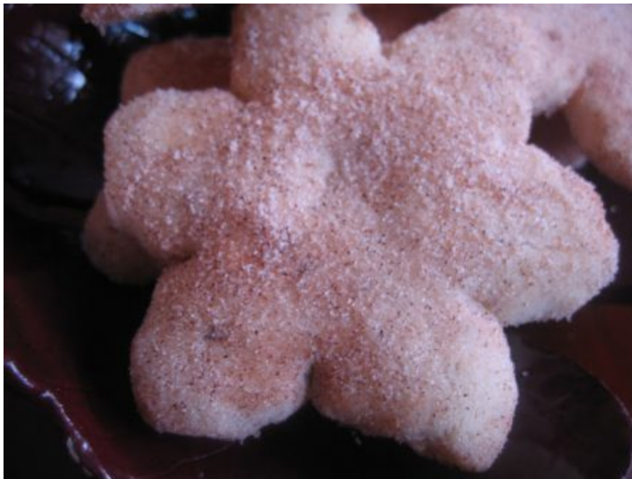
Heirloom Mexican Sugar Cookie Recipe Food and Photo by Rebecka Evans

My winning recipe: Mexican Biscochito Ice cream Sandwiches with Cinnamon Infused Tequila Ice Cream made with liquid nitrogen!