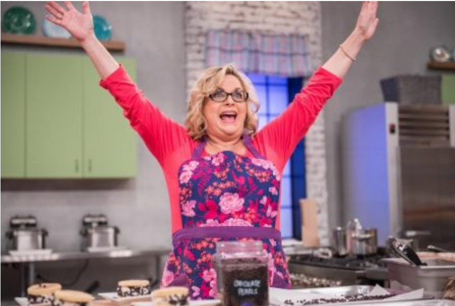
I WON!