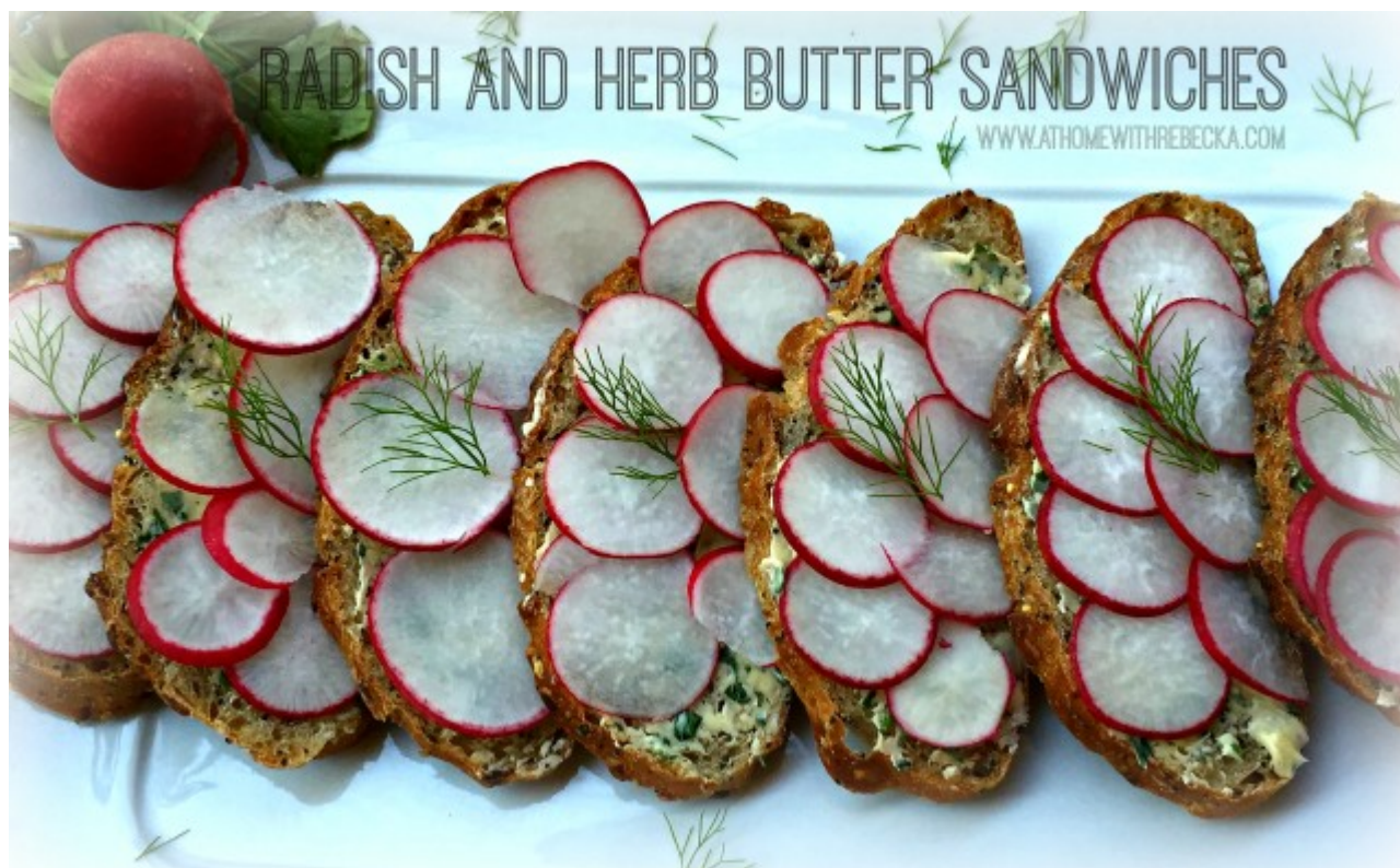
Radish and Herb Butter Sandwiches

Stay tuned for more yummy radish recipes.