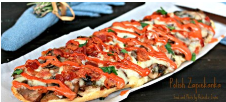
Polish Zapiekanka/Mushroom Toast