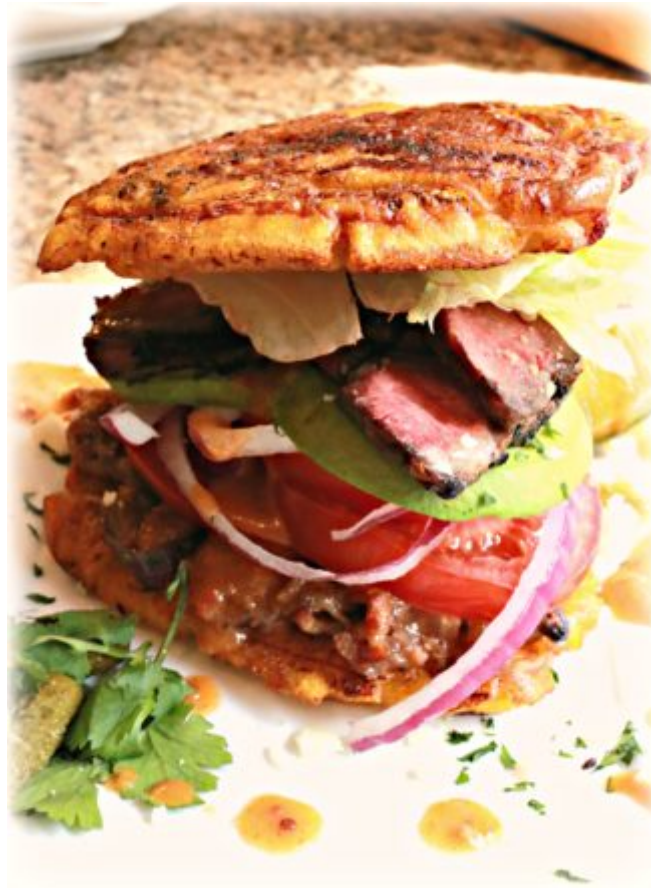
My Second Recipe Submission for Saucy mama Contest FOR THE RECIPE